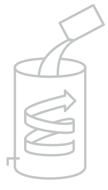
Pour WildBrew Sour Pitch™ into unhopped wort