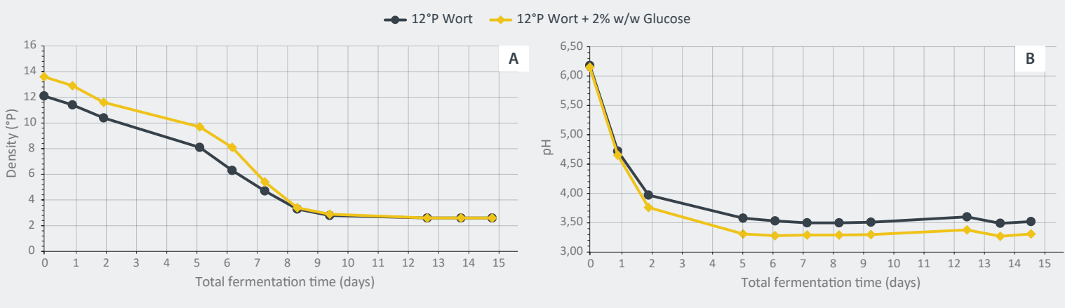
FIGURE 1: Lower pH is achieved by adding glucose.

(A) Fermentation kinetics are shown for a standard wort fermentation compared to standard wort + 2% glucose.